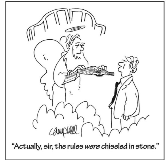
"Actually, sir, the rules were chiseled in stone."

The Elders will be hosting a Coffee Fellowship in the gym on September 3 during the Sunday School hour (9:45-10:45 AM) for your input on what kind of church vehicles we should consider to replace our aging vans.